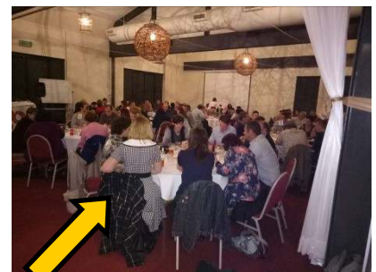
The winning team Trivia Newton John hard at work